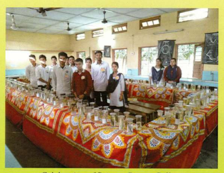
Celebration of Science Day at College