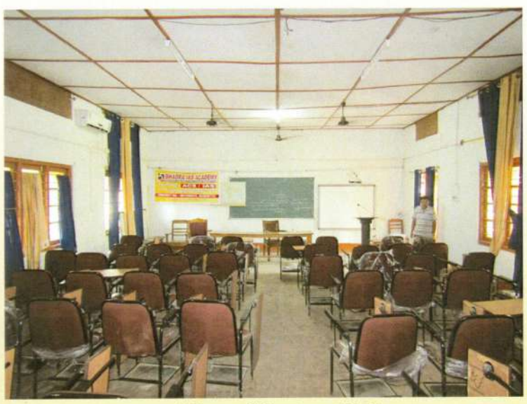
A View of Seminar Hall