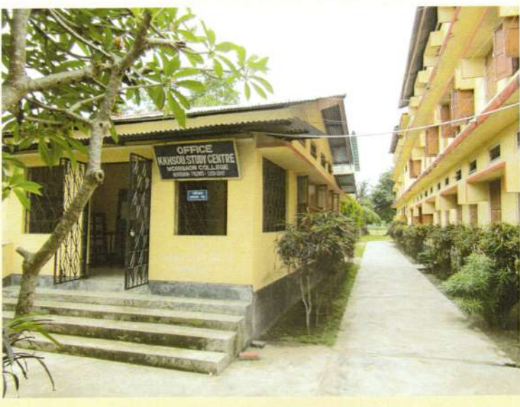
KKHSOU Study Centre