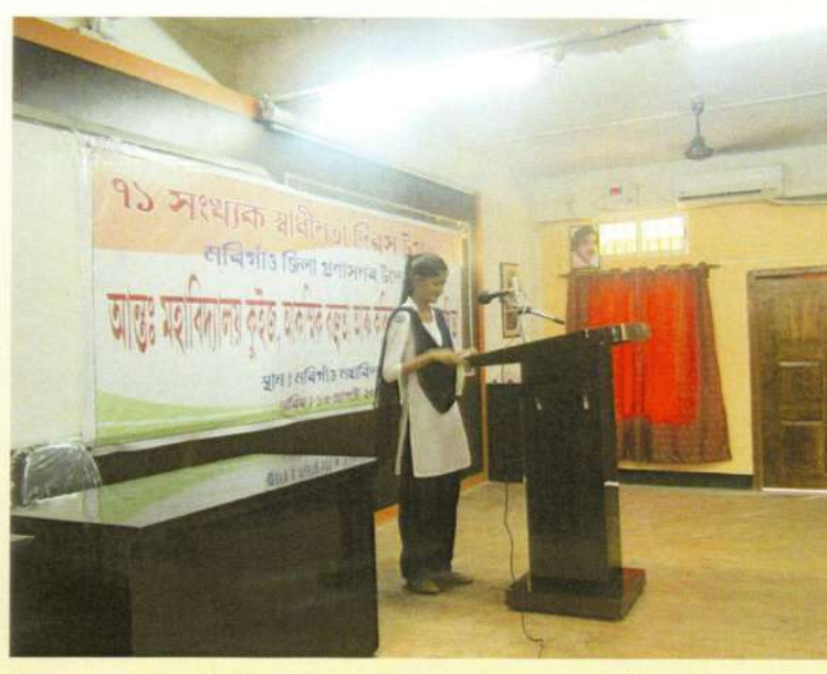
A student participating in extempore speech competition organised by the District Administration in the College