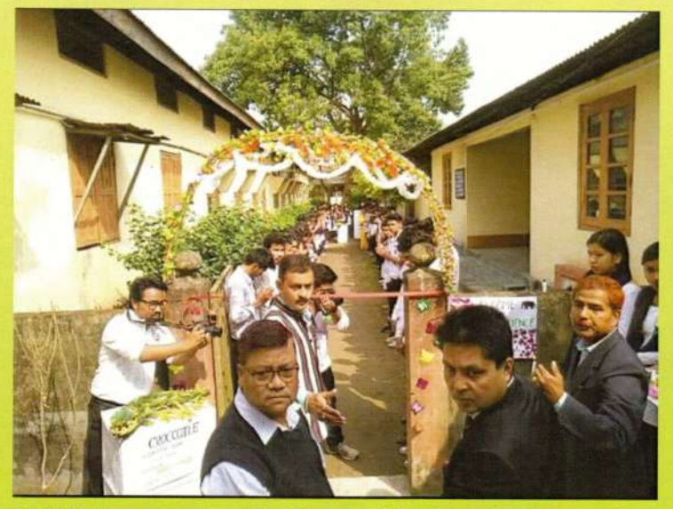
Exhibition organised by Dept. of Zoology on Science Day