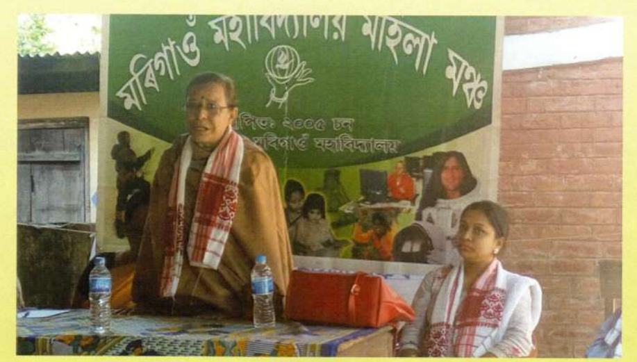
Extention activity by Mahila Mancha at Doloichuba Village