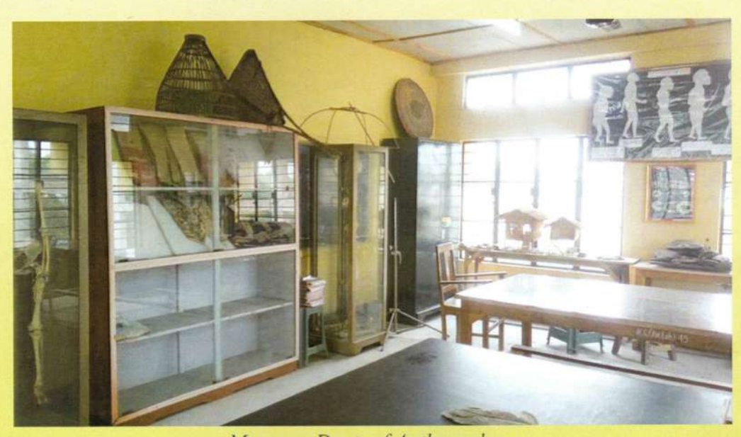
Museum, Dept. of Anthropology