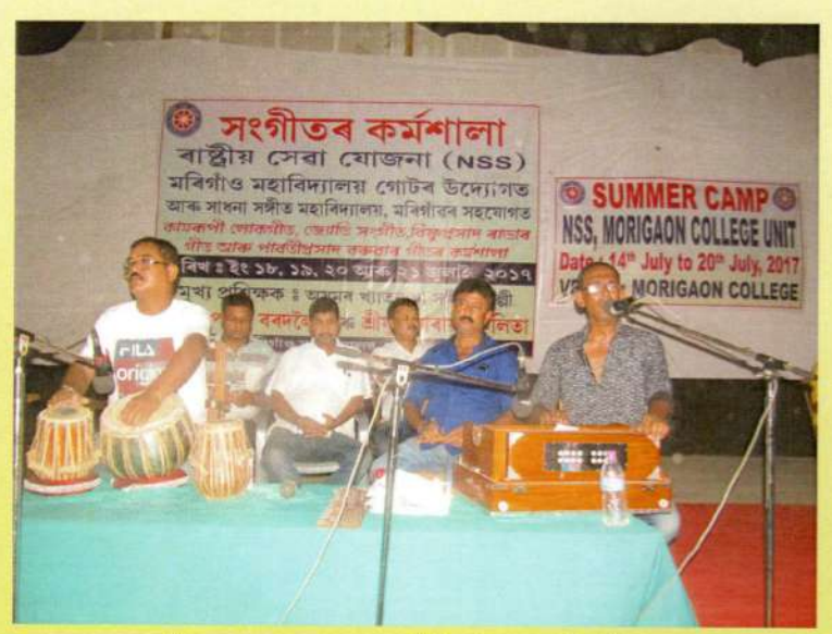
Summer camp at Morigaon College