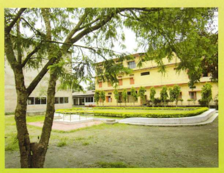
A view of the Campus