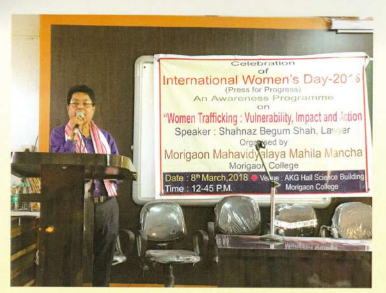
Celebration of International Women's Day