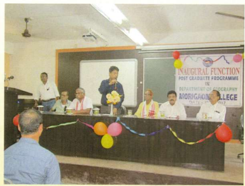
Inaugural Programme of Masters' Degree in Geography