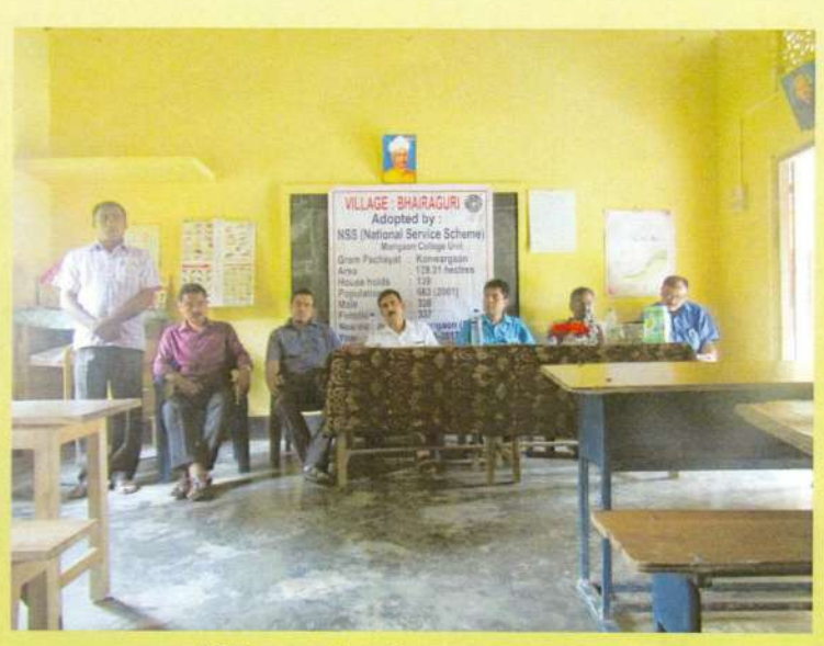
Village adoption programme