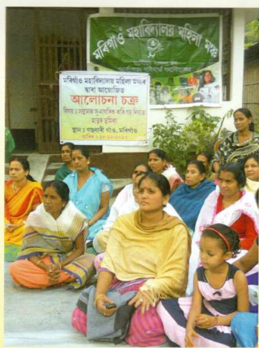
Extention activity by Mahila Mancha at Gasbari Village