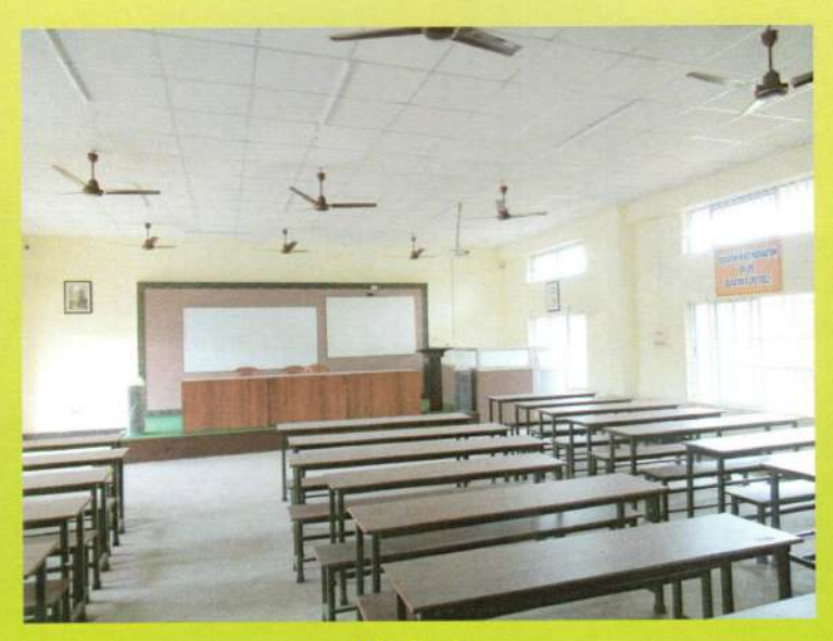
Hall - 1