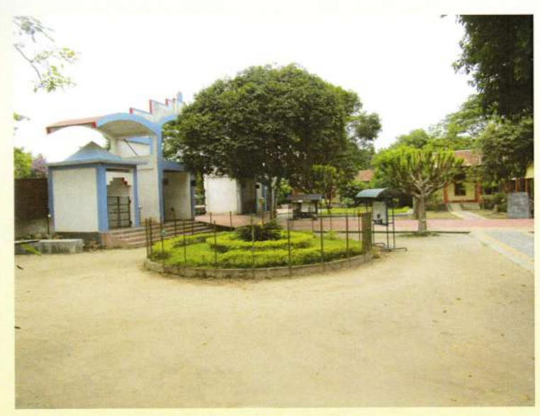
A view of the College